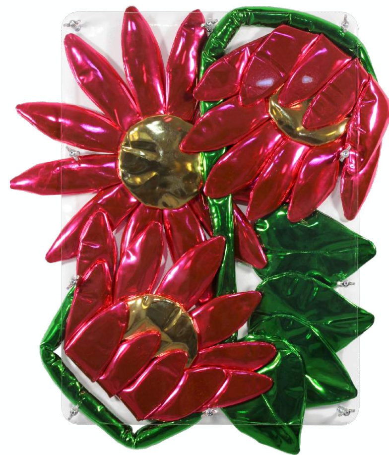
Ant Hamlyn Soft // Chrome Pink Daisies 2026

Hand sewn metallic fabrics, fibre stuffing, polyurethane coated fabric, upholstered architectural fibreboard, extruded acrylic, stainless steel fixings 60 × 40 × 7 cm