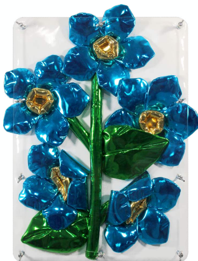
Ant Hamlyn Soft // Chrome Forget-me-nots 2026

Hand sewn metallic fabrics, fibre stuffing, polyurethane coated fabric, upholstered architectural fibreboard, extruded acrylic, stainless steel fixings 60 × 40 × 7 cm