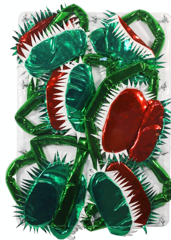
Ant Hamlyn Soft // Chrome Fly Traps 2026

Hand sewn metallic fabrics, fibre stuffing, polyurethane coated fabric, upholstered architectural fibreboard, extruded acrylic, stainless steel fixings 60 × 40 × 7 cm