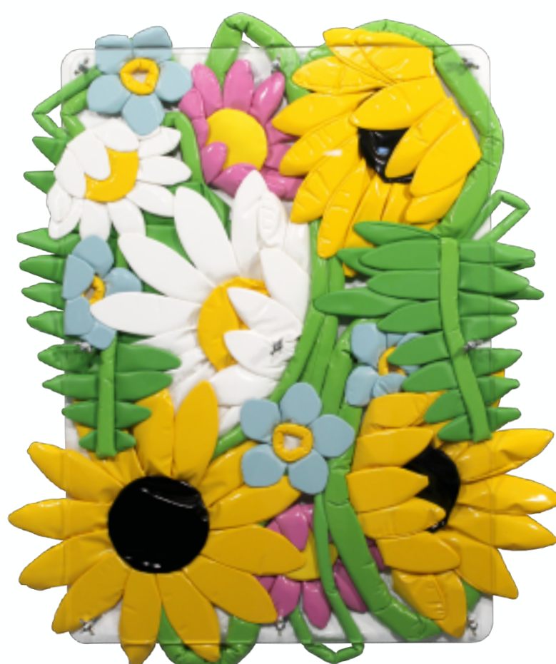
Ant Hamlyn Bouquet with sunflowers 2026

Hand sewn polyurethane coated fabric, upholstered architectural fibreboard, extruded acrylic, stainless steel fixings 75 x 55 x 7 cm