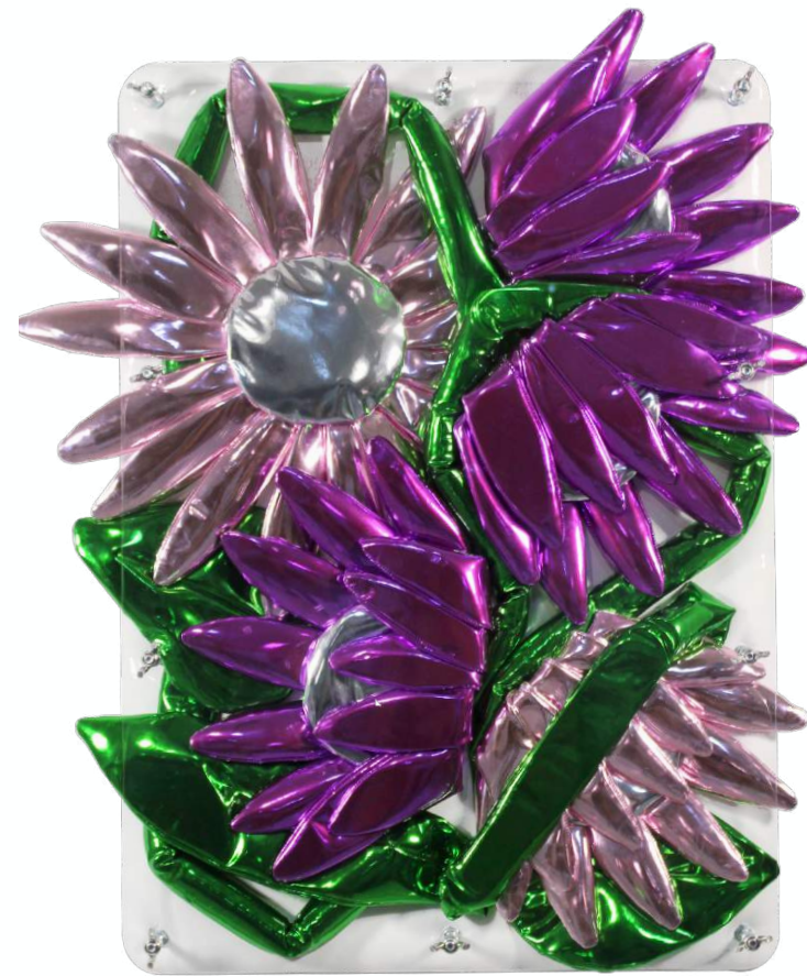
Ant Hamlyn Soft // Chrome Purple Asters 2026

Hand sewn metallic fabrics, fibre stuffing, polyurethane coated fabric, upholstered architectural fibreboard, extruded acrylic, stainless steel fixings 60 × 40 × 7 cm