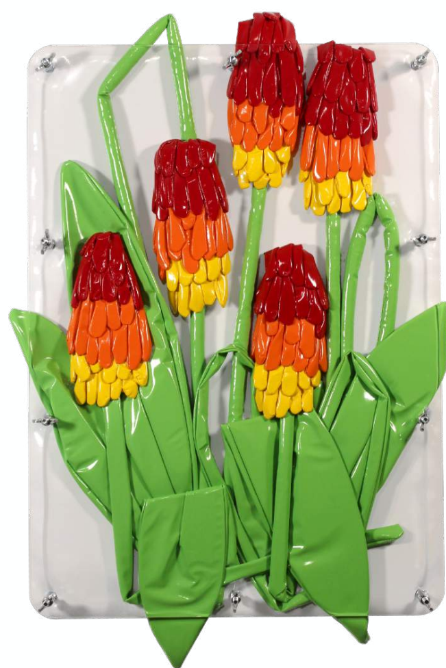
Ant Hamlyn Red Hot Pokers 2026

Hand sewn polyurethane coated fabric, upholstered architectural fibreboard, extruded acrylic, stainless steel fixings 60 x 40 x 7 cm