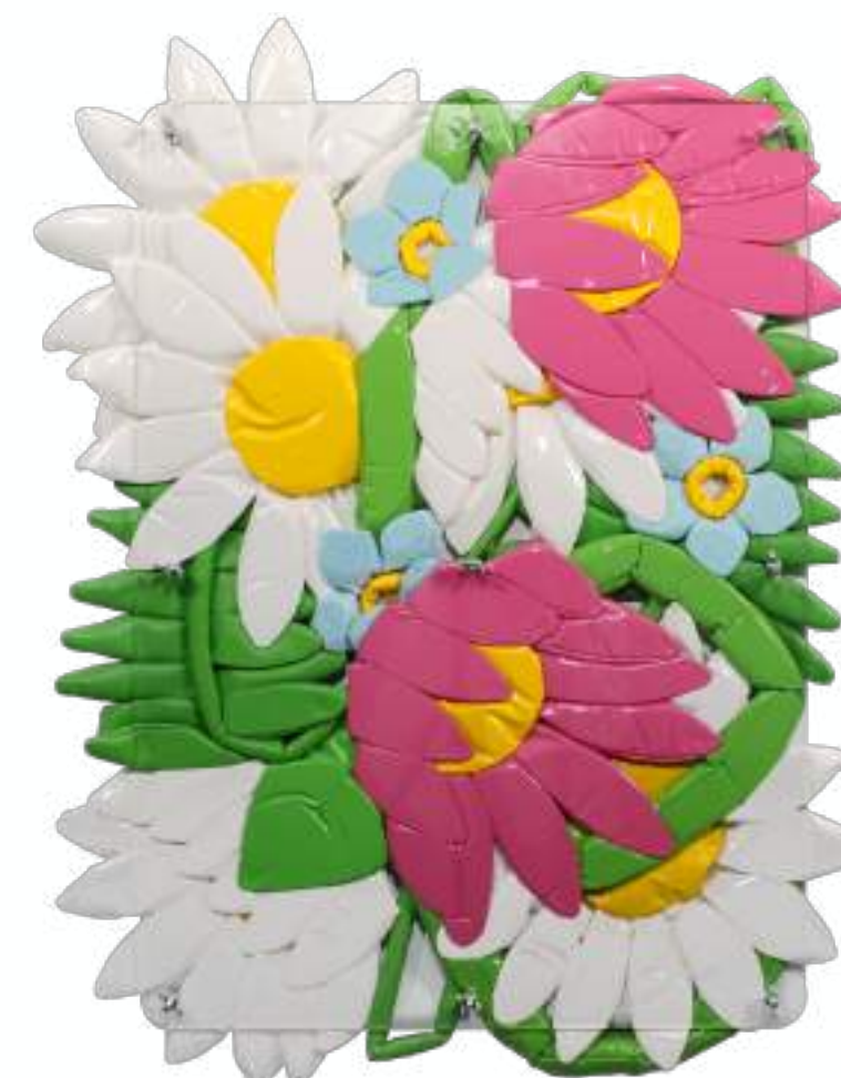
Ant Hamlyn Daisy Bouquet 2026

Hand sewn polyurethane coated fabric, upholstered architectural fibreboard, extruded acrylic, stainless steel fixings 75 x 55 x 7 cm