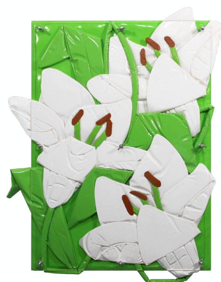
Ant Hamlyn Lillies 2026

Hand sewn polyurethane coated fabric, upholstered architectural fibreboard, extruded acrylic, stainless steel fixings 75 x 55 x 7 cm