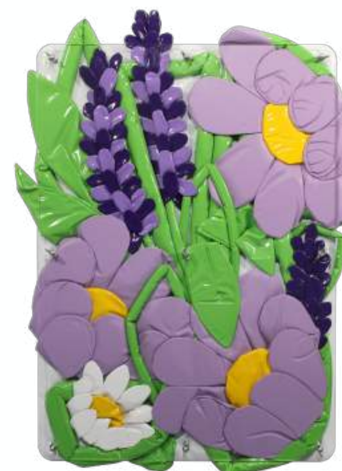
Ant Hamlyn Lavender Bouquet 2026

Hand sewn polyurethane coated fabric, upholstered architectural fibreboard, extruded acrylic, stainless steel fixings 75 x 55 x 7 cm