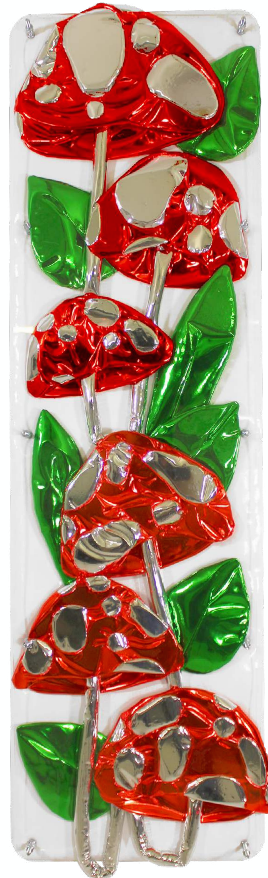
Ant Hamlyn Soft // Chrome Mushrooms 2026

Hand sewn metallic fabrics, fibre stuffing, polyurethane coated fabric, upholstered architectural fibreboard, extruded acrylic, stainless steel fixings 120 × 35 × 7 cm