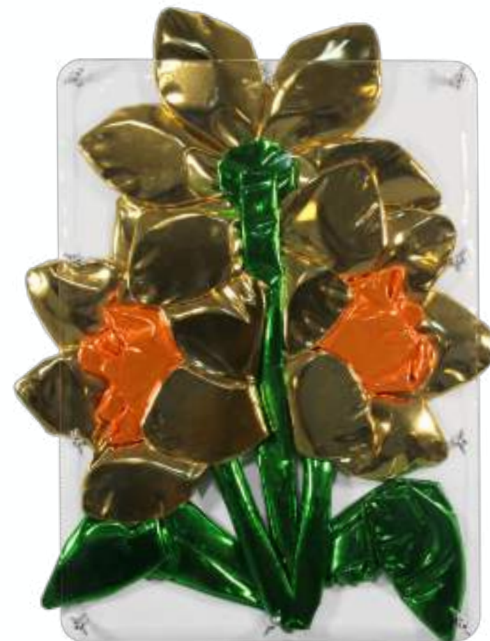
Ant Hamlyn Soft // Chrome Daffodils 2026

Hand sewn metallic fabrics, fibre stuffing, polyurethane coated fabric, upholstered architectural fibreboard, extruded acrylic, stainless steel fixings 60 × 40 × 7 cm