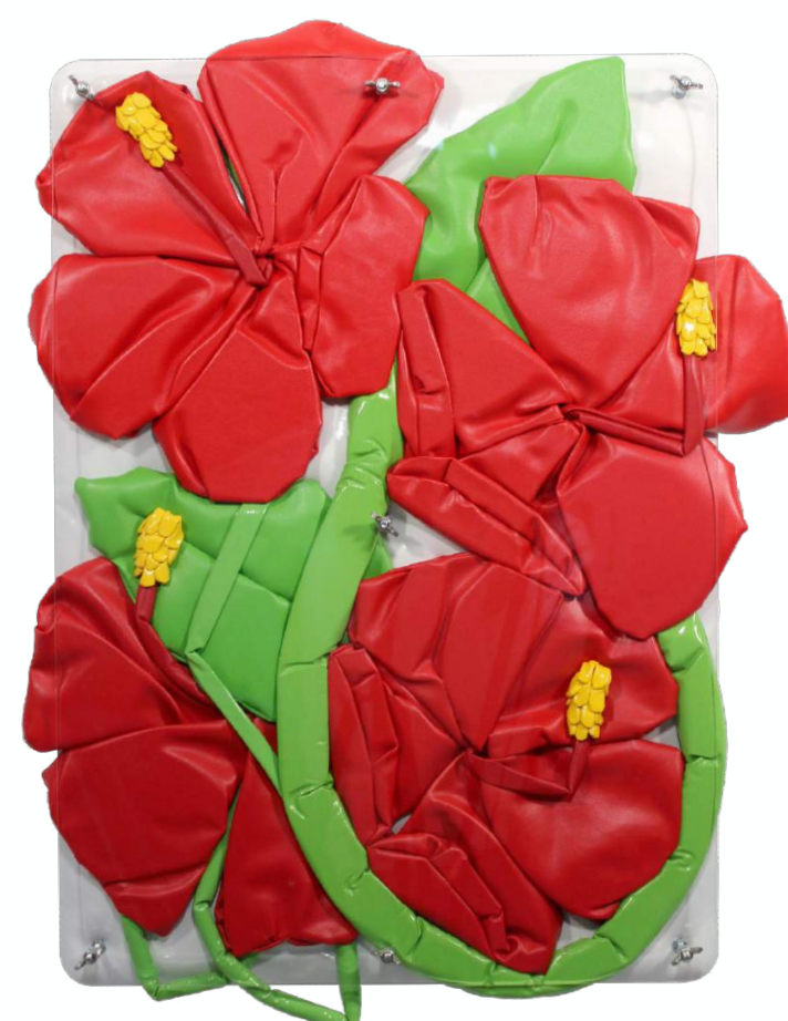
Ant Hamlyn Hibiscus 2026

Hand sewn polyurethane coated fabric, upholstered architectural fibreboard, extruded acrylic, stainless steel fixings 75 × 55 × 7 cm