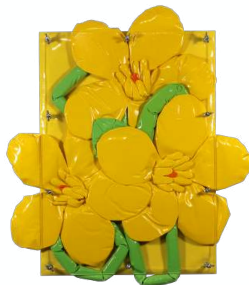
Ant Hamlyn Buttercups 2026

Hand sewn polyurethane coated fabric, upholstered architectural fibreboard, extruded acrylic, stainless steel fixings 60 x 40 x 7 cm