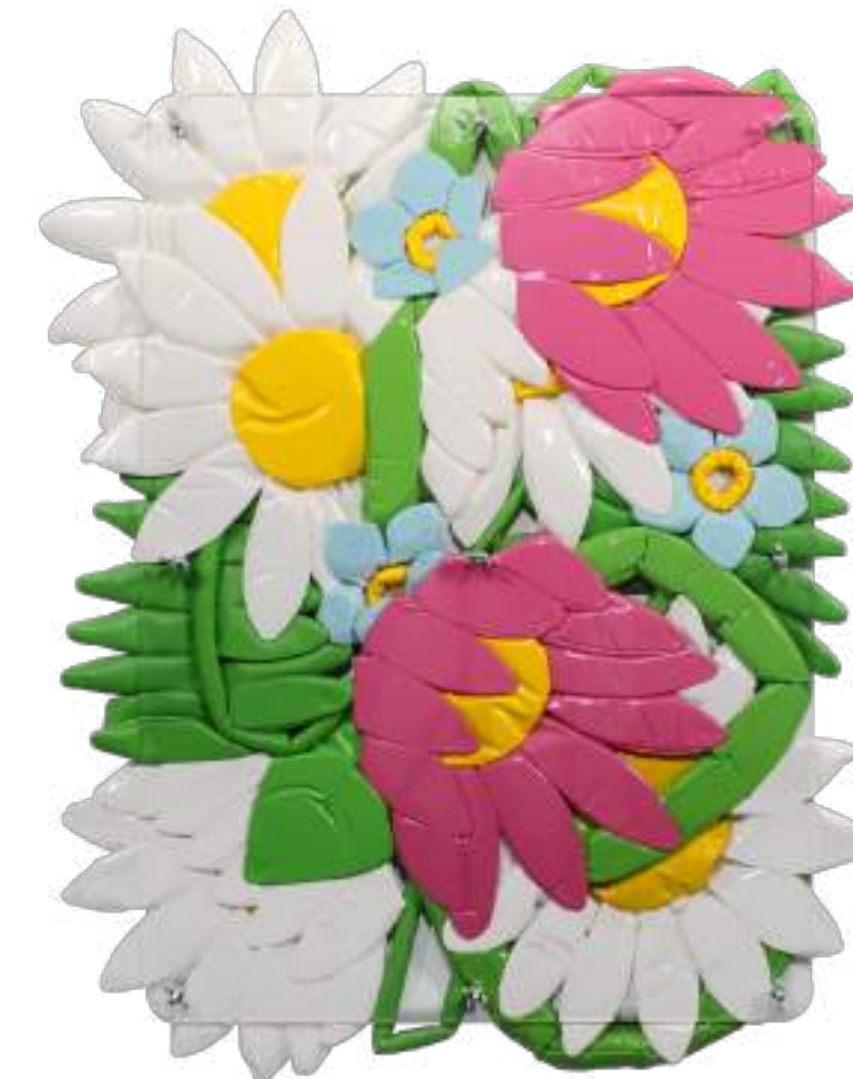
Ant Hamlyn Daisy Bouquet 2026

Hand sewn polyurethane coated fabric, upholstered architectural fibreboard, extruded acrylic, stainless steel fixings 75 × 55 × 7 cm