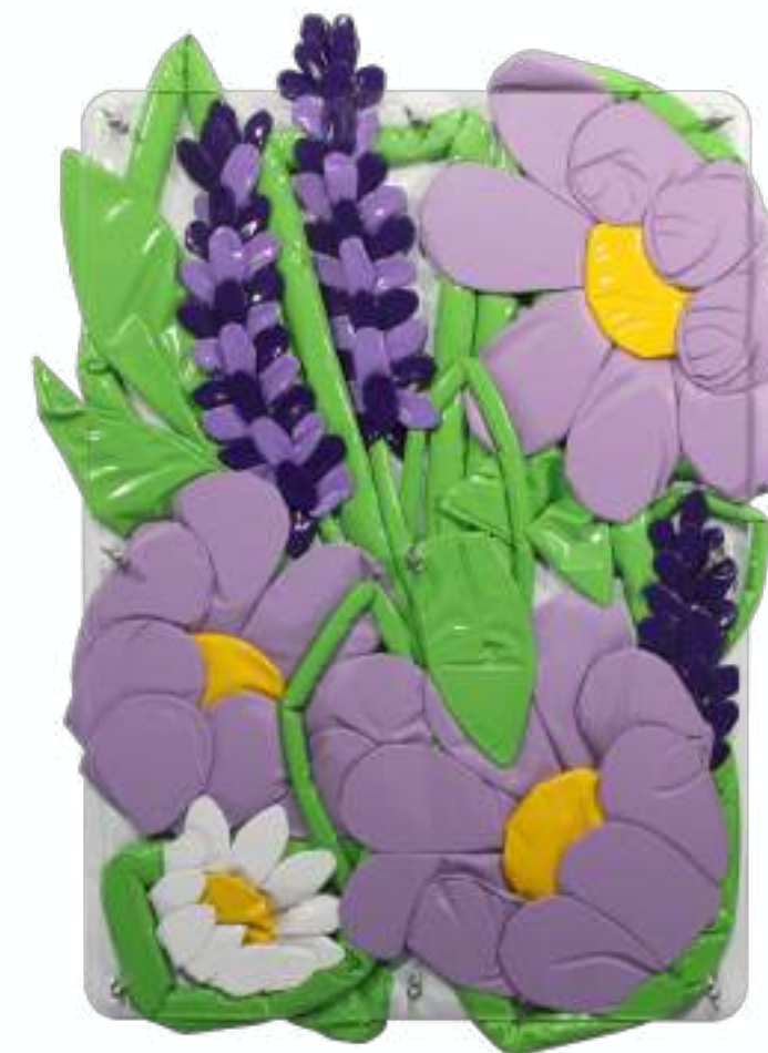
Ant Hamlyn Lavender Bouquet 2026

Hand sewn polyurethane coated fabric, upholstered architectural fibreboard, extruded acrylic, stainless steel fixings 60 × 40 × 7 cm